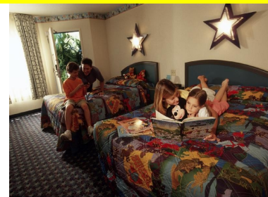
Family time in the hotel after a long day of Field Hockey

To accurately block your room and have the correct number of room keys issued for your room, all expected travelers are required to be listed by name in addition to any special requests*. This should have been completed on or before January 11th, 2012.