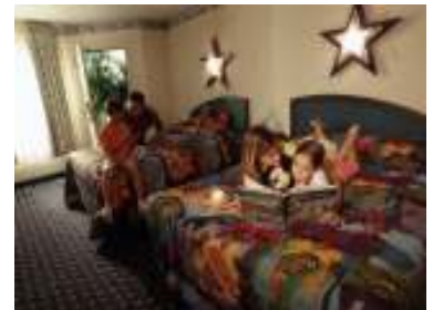
Family time in the hotel after a long day of competition

To have the correct number of room keys issued and to have an accurate bed type assigned to each room, all expected travelers are required to be listed by name in addition to any special requests*. This should have been completed on or before September 5, 2011.